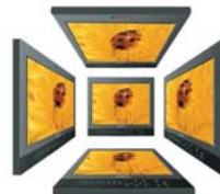
2. 170 degree wide viewing angle